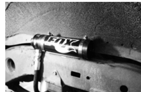
Fig. 5: Driver side