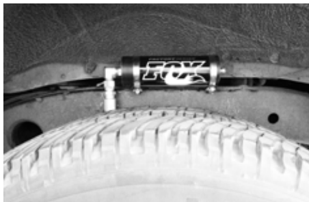
Fig. 7: Driver side