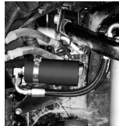
Fig. 3: Driver side