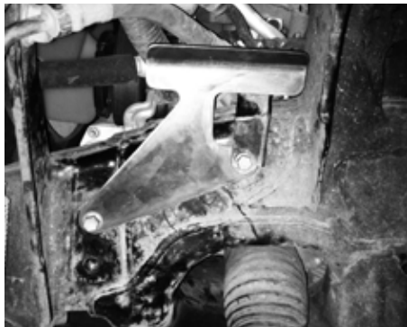
Fig. 4: Driver side