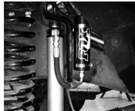
Fig. 1: Driver side