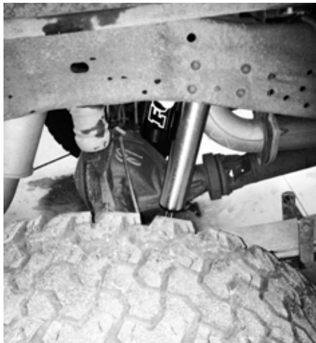
Fig. 3: Passenger side