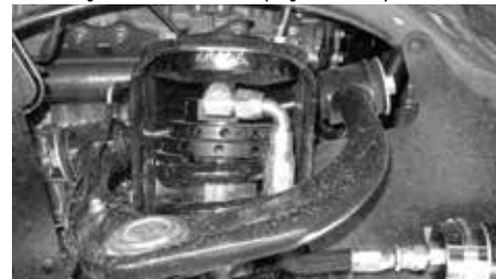
Fig. 2: Passenger side

discard bolt and nut, as it will be used with your new FOX coil-over assembly) 9. Remove the stock shock assembly. You may need to use a pry bar to pull on