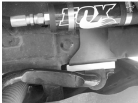
Fig. 4: Passenger side