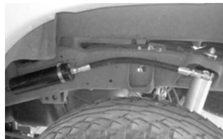
Fig. 6: Driver side rear