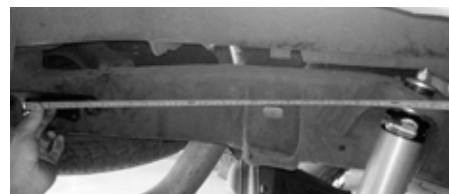
Fig. 5: Passenger side reservoir bracket location rear