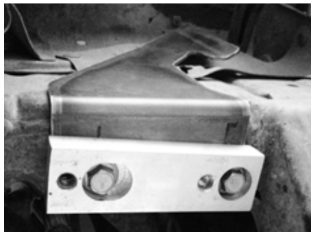
Fig. 3: Driver side sway bar relocation spacer