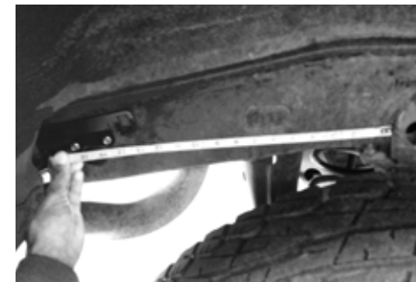
Fig. 7: Passenger side reservoir bracket mounting