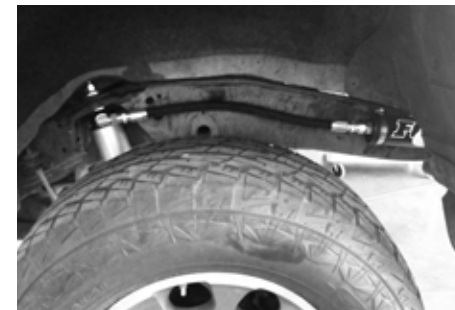
Fig. 8: Driver side

from factory bump stop brace with the top edge of the bracket being flush with the top of the vehicle frame. Mark the center hole and drill a 7/32" pilot hole then secure the reservoir bracket to the frame with one of the