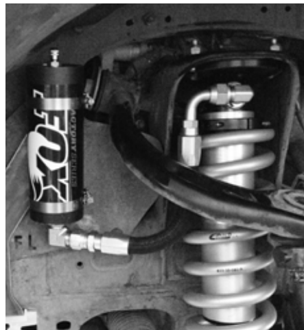
Fig. 2: Driver side hose orientation

sway bar to the vehicle frame. Move sway bar forward to allow clearance for shock removal/installation.