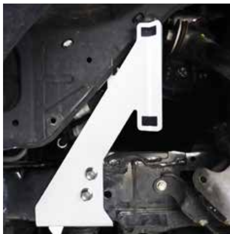
Fig. 4: Driver side reservoir bracket

careful to not to damage any brake lines or electrical wires.