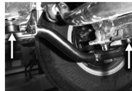
Fig. 6: Skid plate brace spacers