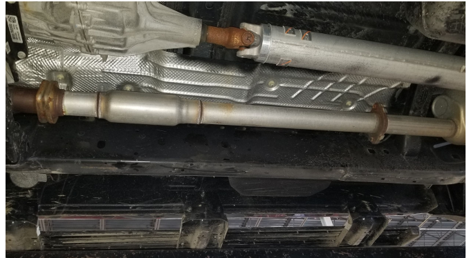
Detail 3: OEM mid section