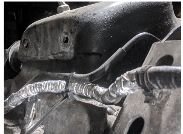
Detail 20b: Wiring secured to brake line