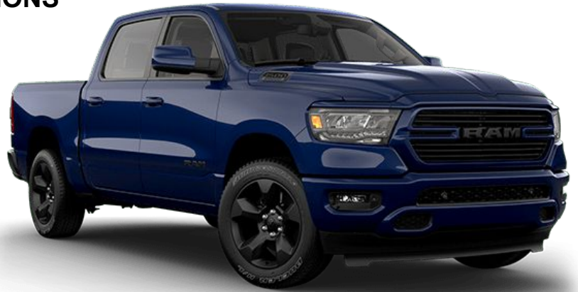
2019+ Ram 1500 (RAM19H)

Thanks for purchasing a Stainless Works Header system for your 2019+ Ram 1500. Our team has worked to ensure that this product is the premium in performance, quality, and fitment. We are proud to say that this system will unleash the true character of your vehicle. We encourage you to read through the following steps, and check the included Bill of Materials before beginning. Please follow these steps to ensure that your installation goes as planned.