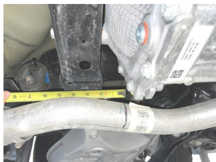
Figure 1 Driver-Side